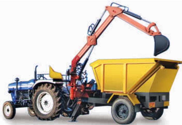
Open Nala De-Silting Machine