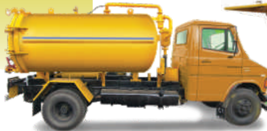
Mini Jetting Machine

Capacity available - 3000 Ltrs 6000 Ltrs