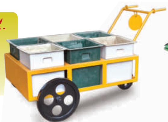
Garbage Containers (Open/Closed Type)