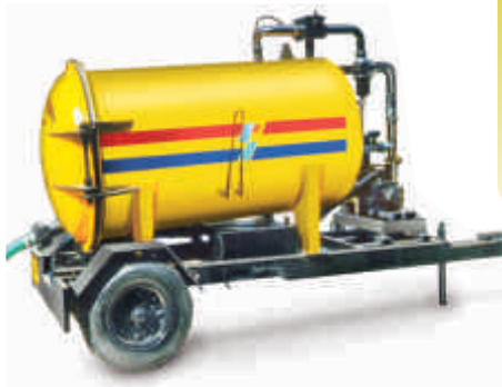
Sewer Suction Machine (Trolley Mounted), 3000 Ltr.