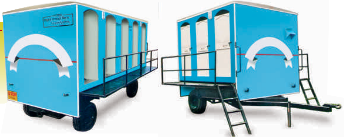
FRP Double Seat Urinal (Gents/Ladies)

Available in - 2 Seat 6 Seat 10 Seat 12 Seat