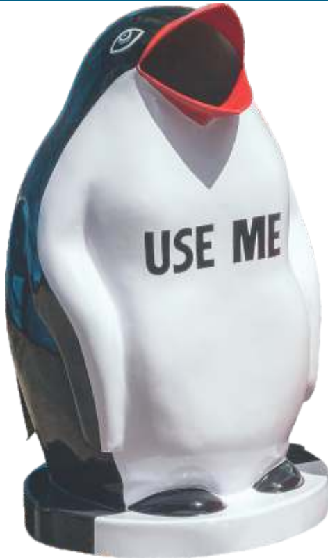
▶ DB1 PENGUIN BIN

Approx Area : 0.65Mtr. Dia. Height : 0.75Mtr.