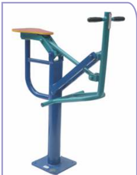
▶ FT9 AERO RIDER

Age Group : 8-16 Years Area : 1 Mtr. X 1.1 Mtr. Safe Play Area : 2.2 Mtr. x 2.1 Mtr.