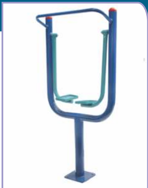
▶ FT7 AIR WALKER

Age Group : 8-16 Years Area : 1 Mtr. X 0.7 Mtr. Safe Play Area : 2 Mtr. x 1.7 Mtr.