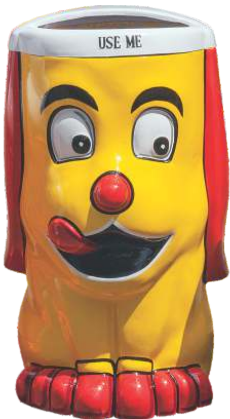
▶ DB3 PUPPY BIN

Approx Area : 0.65Mtr. Dia. Height : 0.75Mtr.