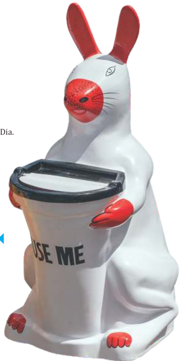
DB2 ◀ RABBIT BIN

Approx Area : 0.4Mtr. Dia. Height : 0.75Mtr.