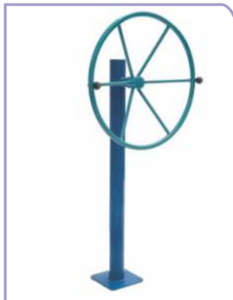
▶ FT10 SHOULDER SPINNER

Age Group : 8-16 Years Area : 1.2 Mtr. X 0.6 Mtr. Safe Play Area : 2.2 Mtr. x 1.6 Mtr.