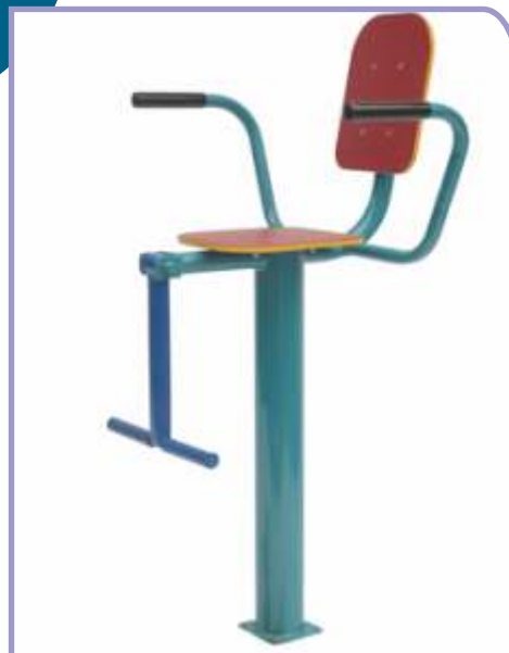
▶ FT8 LEG EXTENSION

Age Group : 8-16 Years Area : 1 Mtr. X 0.7 Mtr. Safe Play Area : 2 Mtr. x 1.7 Mtr.